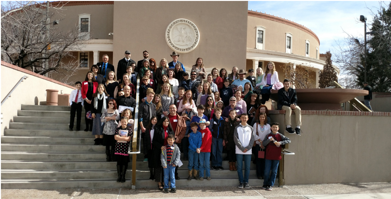
Families from around New Mexico gathered in Santa Fe to meet and greet their legislators and represent homeschooling at the 2017 CAPE at the Capitol Day.

Christian Association of Parent Educators - New Mexico P. O. Box 1506 Moriarty, NM 87035 Website www.cape-nm.org 505-898-8548 info@cape-nm.org